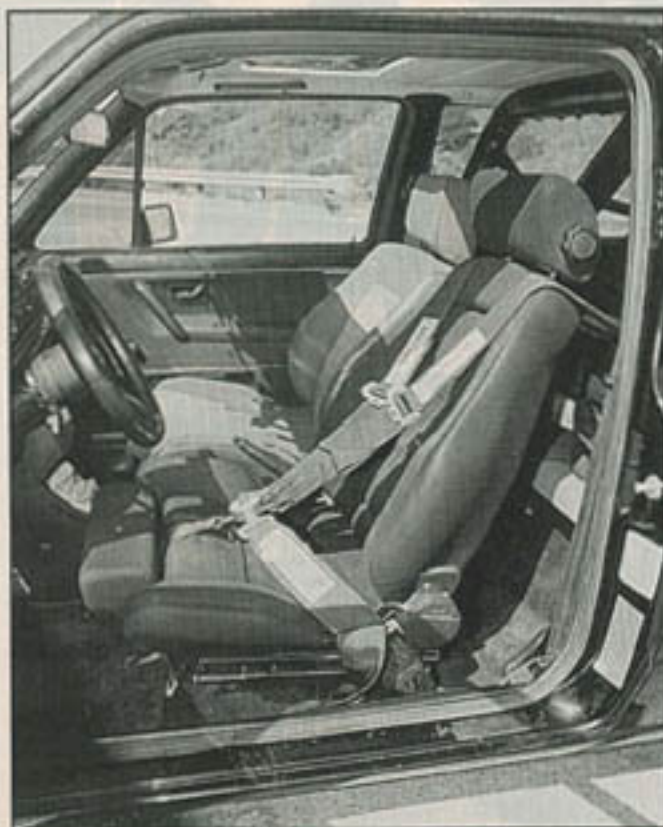
For the racer-esque feel, the homies down at Velocity jazzed up the GTI's interior with Flo-fit drivers seat, Momo steering wheel and shift knob, Autopower race roll-bar, Auto lock pedals, as well as Simpson harnesses.

connected to an R.C. Engineering balanced crankshaft and JE forged pistons boasting 10:1 compression.