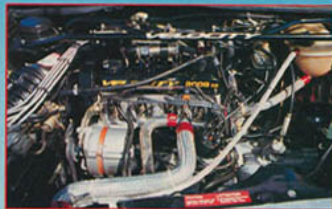
ABOVE - There are quite a few killer performance products languishing within this engine. A R.C. Engineering balanced crankshaft, JE forged pistons, and Neuspeed 268 camshaft, just to name a few.