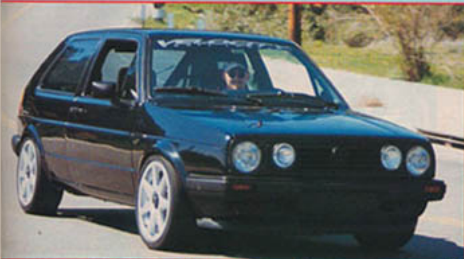
LEFT - With all the engine goodies massaged on, this bad black GTI cranks out a cool 145 horsepower at 5,250 rpm. Heeeyyyy.