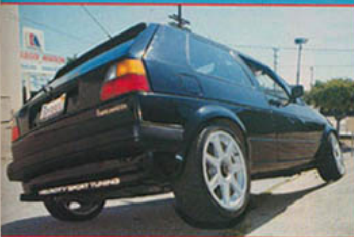
For any angle this ride be lookin' good.