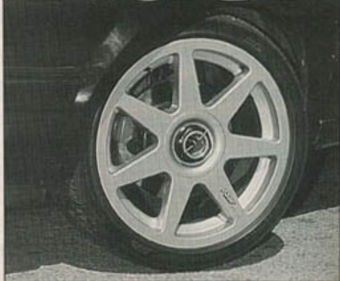
For performance and good looks, a set of 17X7.5-inch TSW EVO wheels wrapped in Yokohama AVS II tires were added.